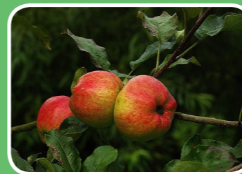
Welsh Heritage Fruit Orchard

"Treborth Botanic Garden is a hidden gem, nestled between two historic bridges along the shores of the Menai Strait"