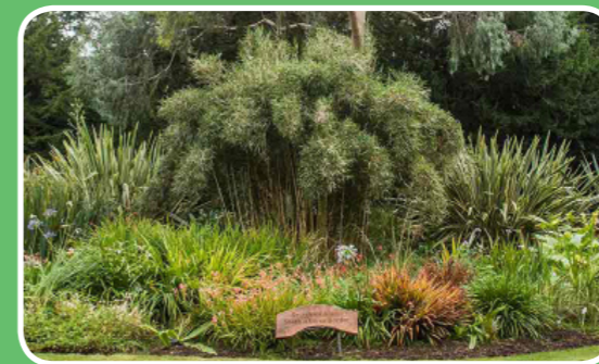
South African Border